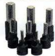
POWER AND HAND TORQUE TOOL